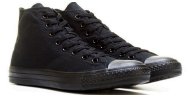
High top canvas boots